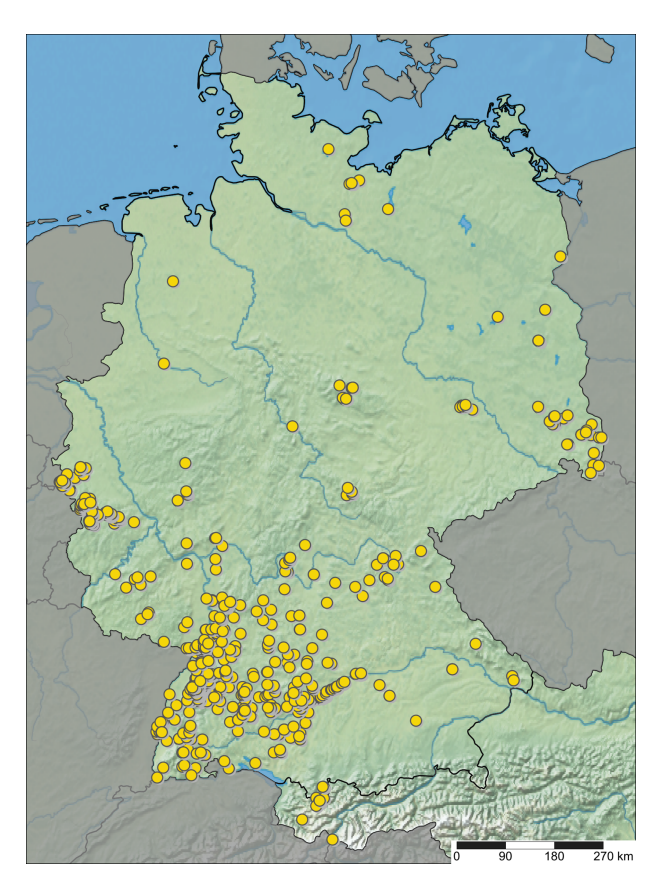
Figure 1. Sampling sites with spider assemblage data available in ARAapp, with data from 26 October 2023.

Alt Text: A map of Germany and Austria with dots marking the sampling sites available for analysis in ARAapp.