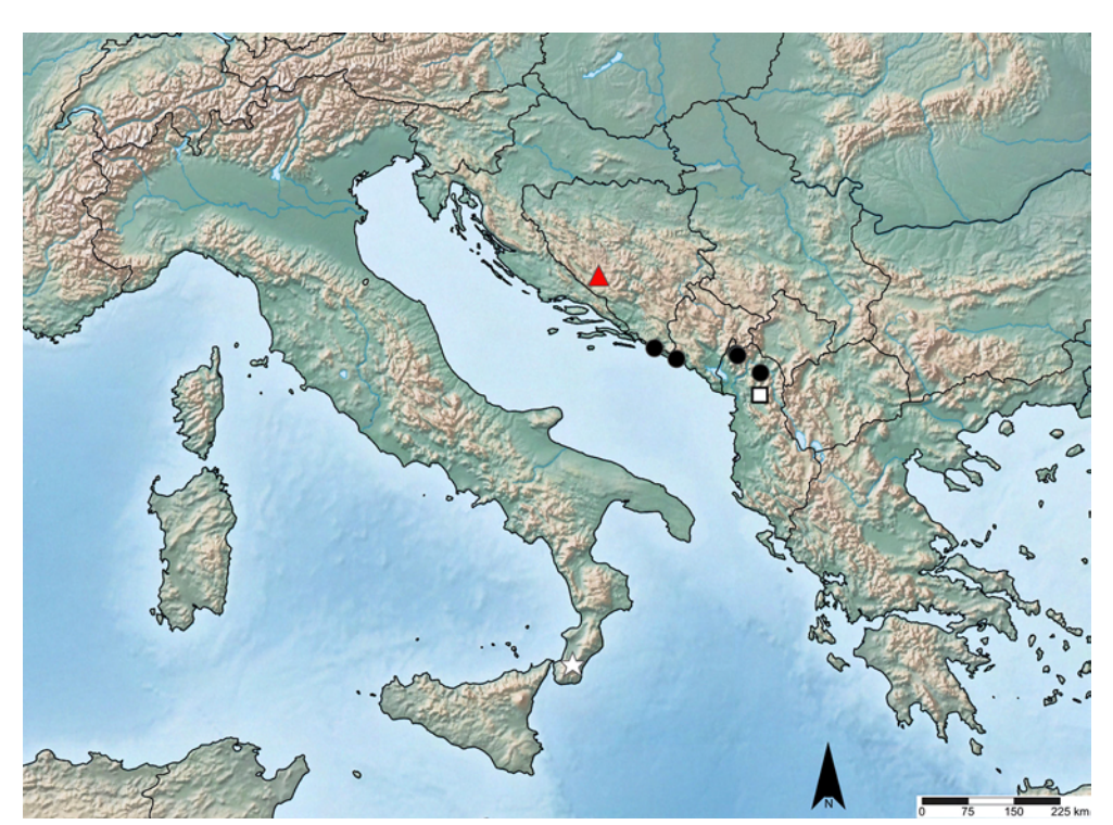
Fig. 4: Records of Xysticus brevidentatus on the Balkan Peninsula and in Italy. Red/grey triangle = new record from Bosnia and Herzegovina, black dots = records from Balkan Peninsula in the literature, white star = dubious record in Italy (Jantscher 2003). White square = record from "northern Albania" without exact location in Jantscher (2003), the symbol is set arbitrary.

Astrin et al. (2016) have shown that at least two species within the X. cristatus group (X. cristatus (Clerck, 1757) and X. audax (Schrank, 1803)) are not separable on the basis of COI (barcode) sequences, which might be attributed to occasional hybridisation resulting in mitochondrial introgression between these very closely related species. Additional published barcode data in the BOLD database (http://doi. org/10.5883/BOLD:AAP2437) show that the same COI haplotypes are also shared by X. gallicus Simon, 1875, X. slovacus Svatoň, Pekár & Prídavka, 2000 and X. macedonicus (e.g., X. macedonicus SPSLO281-12 from Switzerland identified by M. Kuntner, unpublished; X. gallicus GBMIN117776-17 from Greece and X. slovacus GBMIN117780-17 from Slovakia, reported in Gawryszewski et al. 2017: Suppl. Tab. 1). This indicates a considerable amount of genetic permeability of the species barriers in the X. cristatus species group.