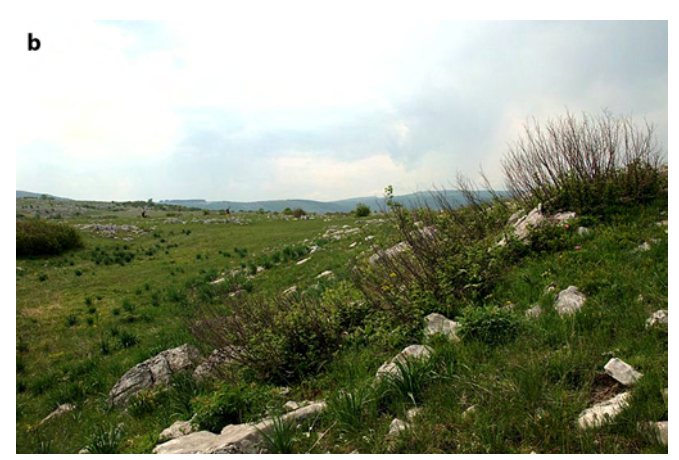
Fig. 3: Locality of Xysticus brevidentatus in Bosnia and Herzegovina. a. grassland near Galečić; b. male and female were collected by sweep netting on low bushes.

to be expected. One of the records in Deltshev et al. (2011) was found at an altitude over 2000 m, which represents the highest known location of the species. The single record in Southern Italy (Aspromonte, Jantscher 2003), collected in 1906 by the well-known Austrian entomologist Gustav Paganetti-Hummler (OEBL 2020), represents the only specimen known from outside the Balkan Peninsula, and the species has not been collected in Italy again since then. We only found X . macedonicus in the Aspromonte massif, and Jantscher already mentioned that the single male specimen of (supposedly) X. brevidentatus from the Aspromonte massif differs in having an unusual short embolus and tutaculum. Xysticus macedonicus, a very similar and much more widespread species, was recently found in several mountainous regions in Italy outside the European Alps (IJland & van Helsdingen 2019, and our material). Although we were not able to examine the single record of X. brevidentatus from Italy, our material, the findings of IJland & van Helsdingen (2019) and the original remarks of Jantscher raise doubts about the correct determination of the specimen. Jantscher examined several specimens