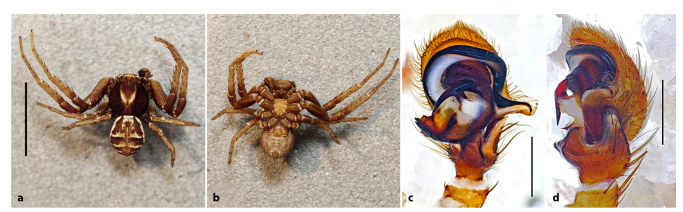
Fig. 2: Xysticus brevidentatus , male from Bosnia and Herzegovina. a. habitus dorsal view; b. habitus ventral view; c. pedipalp ventral view; d. pedipalp retrolateral view; scales; a. b = 5 mm, c. d = 0.5 mm

Based on the distribution reported in the literature, an occurrence of X. brevidentatus in Bosnia and Herzegovina was