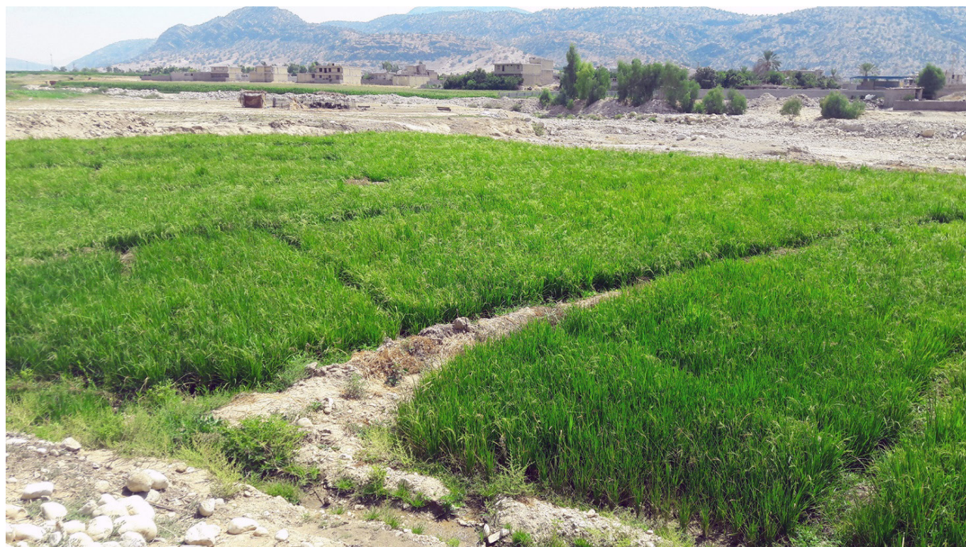
Figure 1. Habitat and collecting site of Parawenhoekia aginapaica (Haitlinger, 1999) in Fars Province, Iran with its vegetation cover.

Distribution. Cyprus, Iran ( new country record )