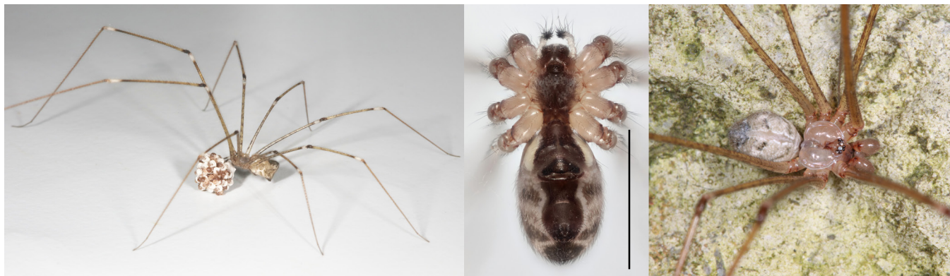
Figs 1-3: Crossopriza lyoni (Blackwall, 1867) from Wilhelma (SMNS 1205), Zoological-Botanical Garden Stuttgart. 1. Female with egg-sac 2. Female, ventral side (scale line = 5 mm). 3. Male (SMNS 1103)

spider population recovered after some months. Other spider species which have been collected together with C. lyoni are Steatoda triangulosa (Walckenaer, 1802) and S. bipunctata (Linnaeus, 1758). In only one case, a single female of Pholcus phalangioides was found.